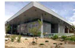
Parkdale Recreation & Senior Center and Water Park (702) 455-7517